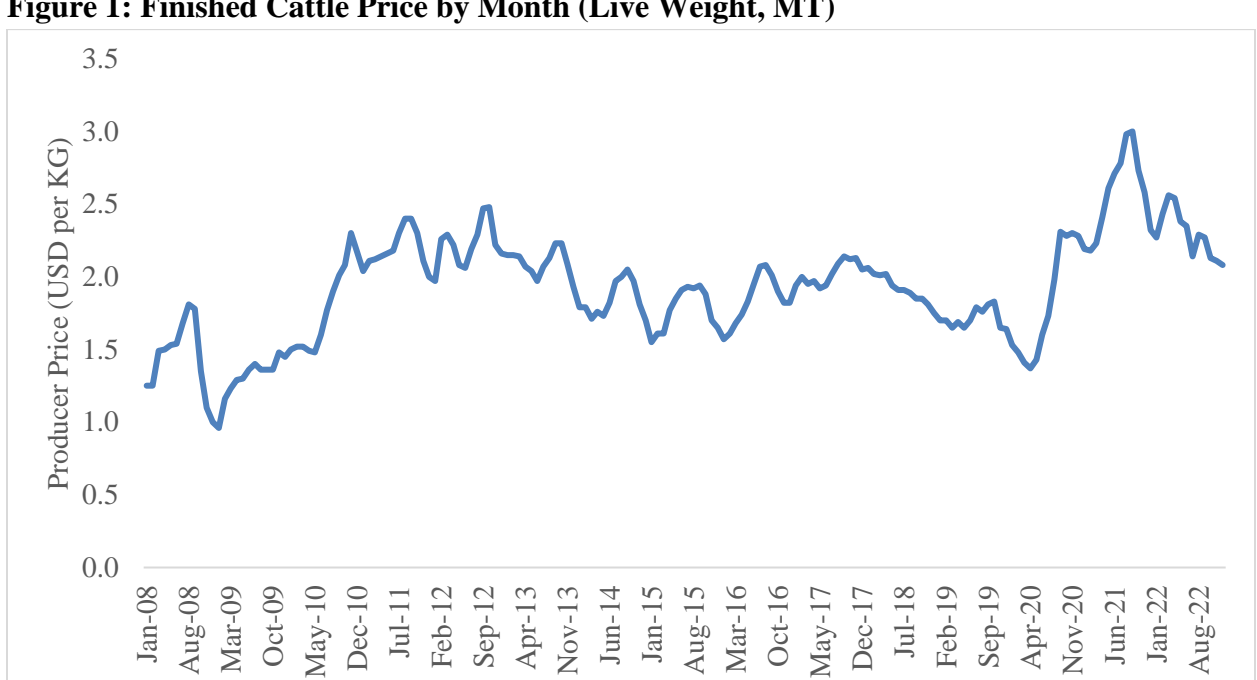
Figure 1: Finished Cattle Price by Month (Live Weight, MT)